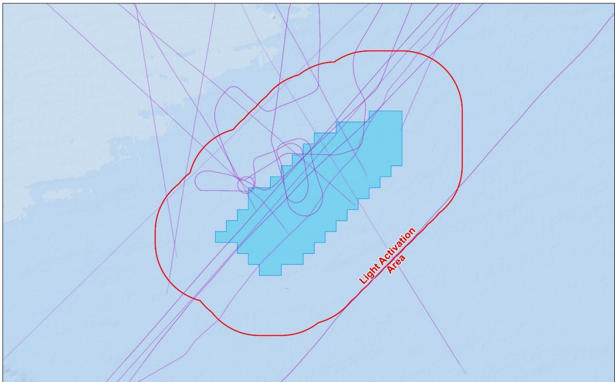
Figure 3: Flight tracks (purple) with more than one radar return that would have activated ADLS obstruction lights (based on 1,165-foot (355-meter) tall wind turbines)